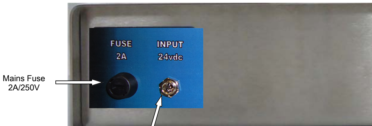
Figure 1—Rear View